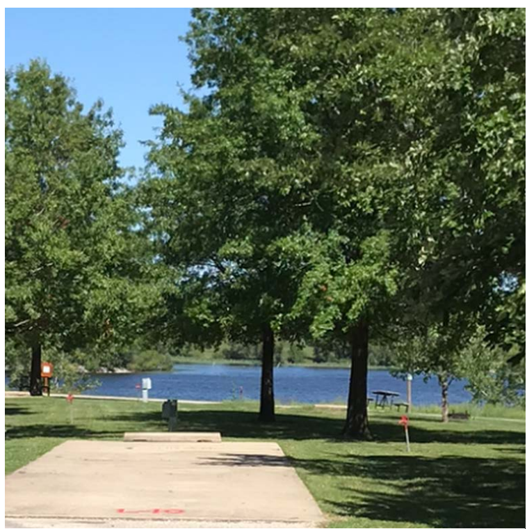
Improvements at Lake Sugema helped make this one of the county's most popular campgrounds.

In the fourteen years since the state designated the Villages of Van Buren County an Iowa Great Place, we have realized or have made significant progress on the projects identified under previous designations. We