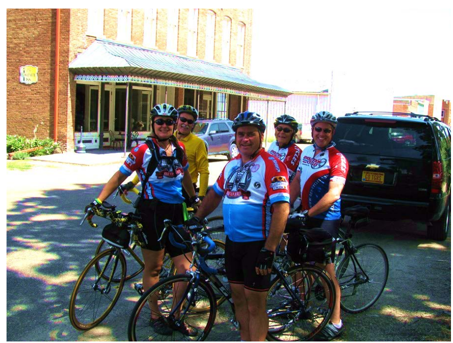
Bike Van Buren, now in its 37<sup>th</sup> year, draws bike enthusiasts from across the county. Residents and visitors desire more trails.

Our county tourism organization widely markets the "Villages of Van Buren" brand, and the county is recognized statewide and regionally as a unique and authentic place to visit where visitors can enjoy the county's quiet and pastoral landscape, rolling hills, broad Des Moines River valley, vibrant artist community, and historic architecture. The Chicago Tribune noted "Van Buren County still lives up to its past; in fact, its past never left."