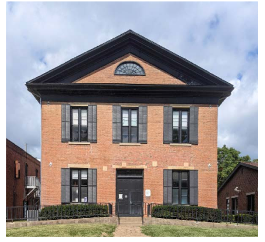
Van Buren County's Greek Revival style courthouse is Iowa's oldest courthouse in continuous use. The Great Places committee has identified the restoration of this building as a priority project.