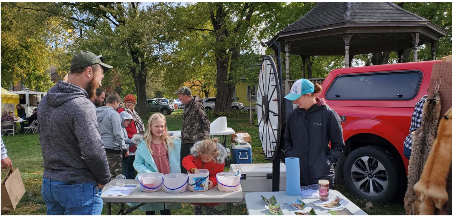
The Van Buren County Conservation naturalist (far right) offers educational programming for children and adults during the county's events. The 10year vision plan identifies a nature center with permanent exhibits and classrooms to supplement outdoor learning.