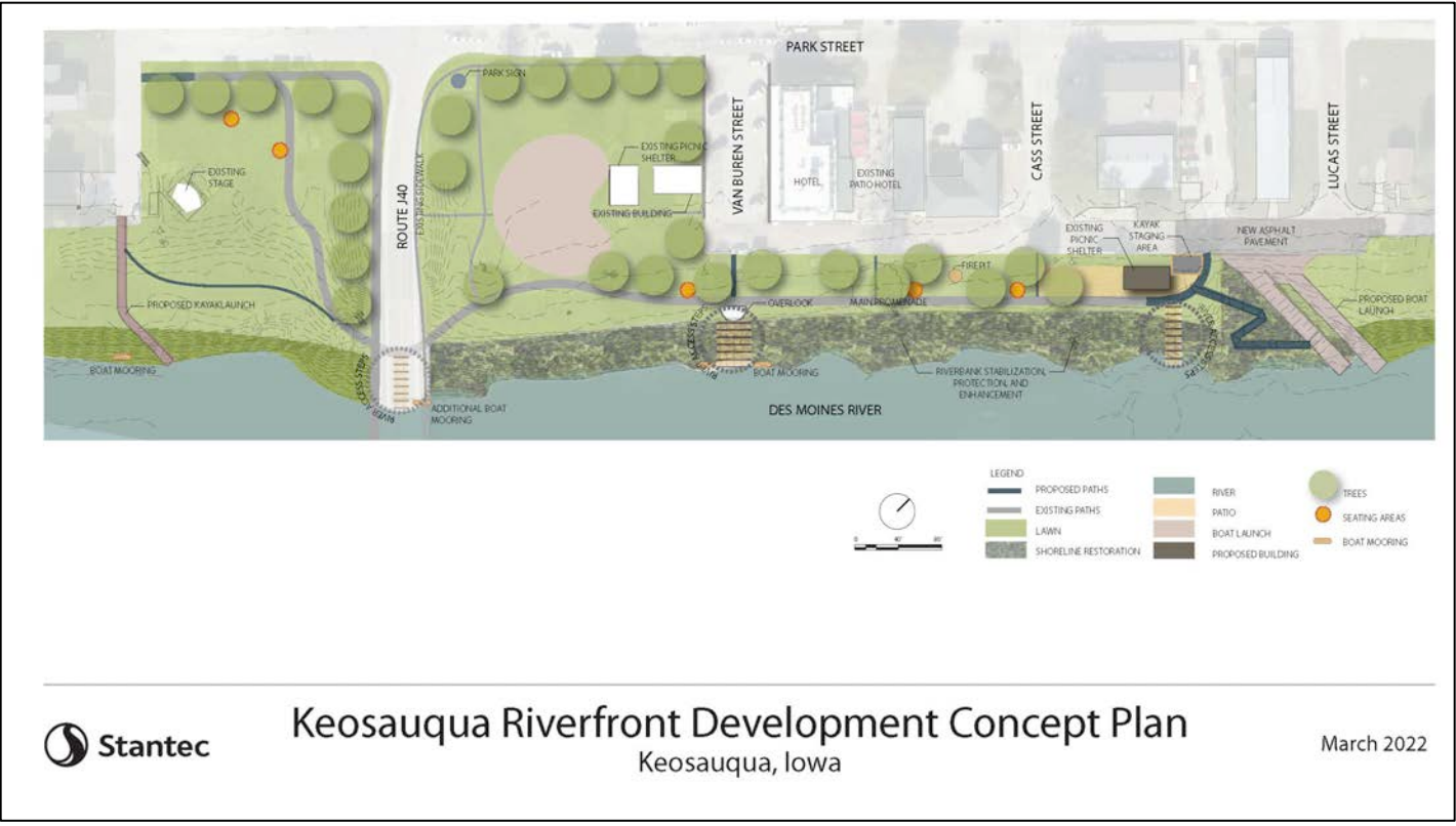
This plan for the Keosauqua Riverfront is one piece of the vision plan's larger project to enhance river access.