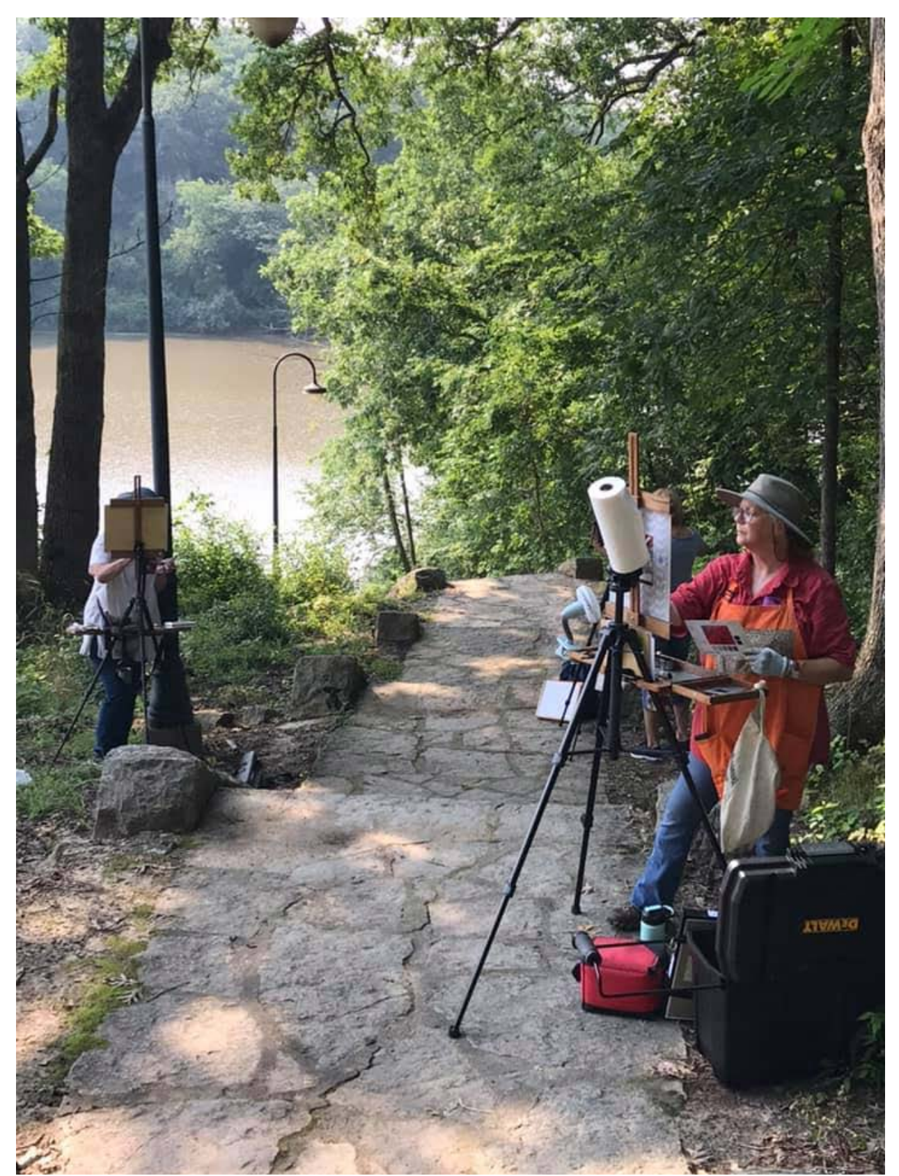
Plein air painting is one of the Folk School's most popular events. The Great Places committee plans to create a permanent space for the Folk School studios, classroom, retail, and exhibition space for local artists.