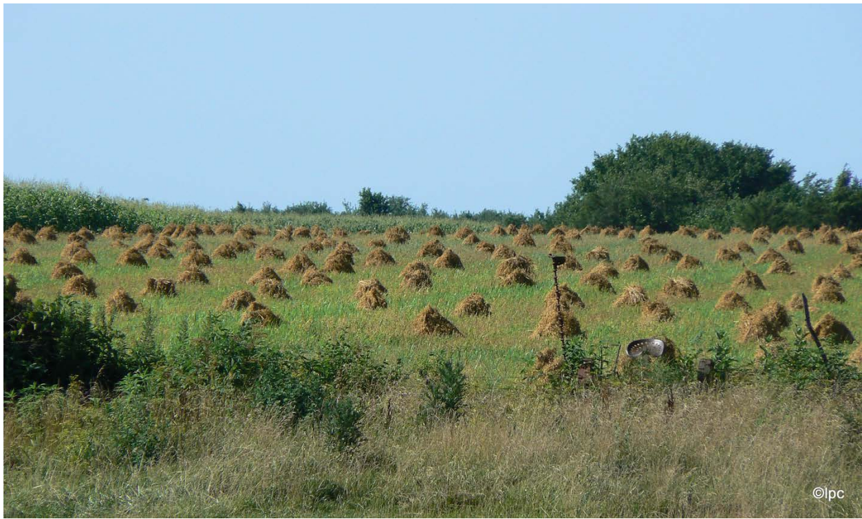
Van Buren County's pastoral landscape includes these Amish hay shocks along Route J40.

One of our Great Places committee members describes Van Buren County as "small but mighty." The county's population is 7,203 (2020 census) making it the tenth smallest in the state. The county includes large Mennonite and Amish populations. Seven incorporated towns along with four unincorporated villages make up the "Villages of Van Buren." Agriculture, retail, industry, and tourism fuel the local economy. Residents boast that there are no stoplights or chain restaurants in the county. Despite our strong rural qualities, Van Buren County's independent telephone company provides service to most of the residents with a 100% fiber-optic network, enabling e-commerce, telecommuting, and robust telemedicine for the county hospital.